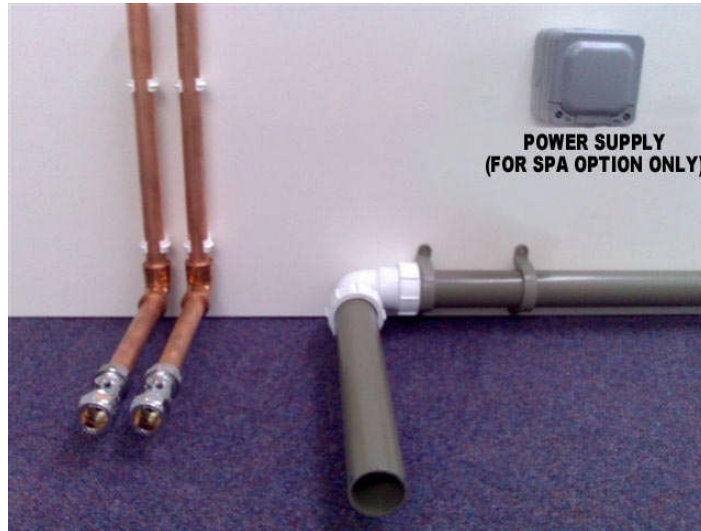
(Photograph for illustration purposes only)

It is important that the installer is made aware of the location of water stop cocks and mains electric RCD/trip switch on arrival to the property.