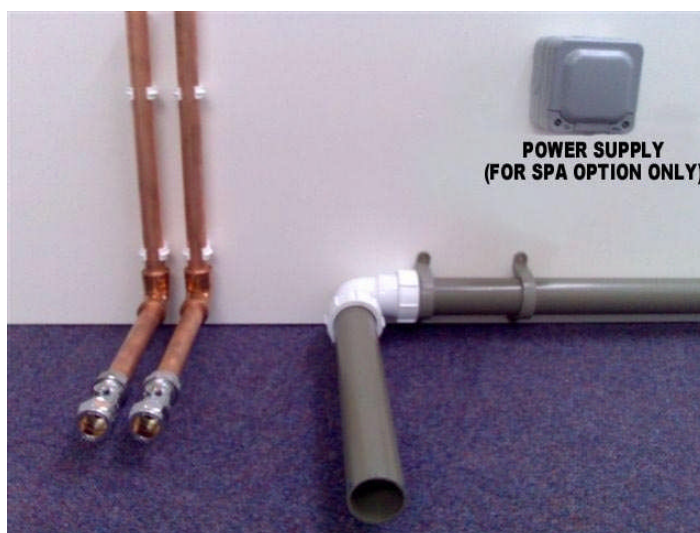
(Photograph for illustration purposes only)

It is important that the installer is made aware of the location of water stop cocks and mains electric RCD/trip switch on arrival to the property.